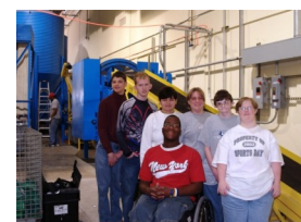
Team Members from Texas School for the Deaf Program

Sustainability • Security • Technical Innovation • Community