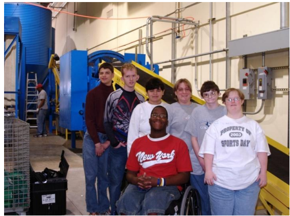
Team Members from Texas School for the Deaf Program

Our partnership with the Texas School for the Deaf (TSD) is unique. We sponsor TSD students through their Career Technology Education Program. By employing both deaf and special needs students in our Recycling Manufacturing Department, we provide paid internships—giving each student exposure to the world of technology and environmental responsibility. The students receive real world experience in the job market. After graduation from TSD, these students are qualified and able to apply for full time employment. In fact over 25% of our workforce is deaf. We have a full time American Sign Language translator on staff, enabling us to integrate and learn from these great people. The students have changed the work environment for our other employees as well. They inspire us daily. We can't imagine not having this special community in our workplace.